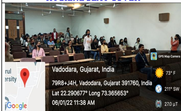
Participants Students from JNHMC