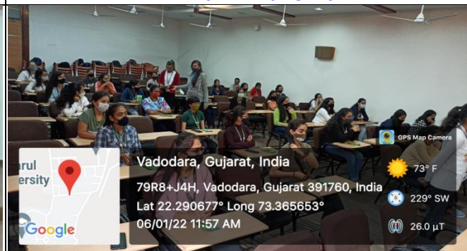
Distribution Of Hygiene Seat Cover To All Female Student