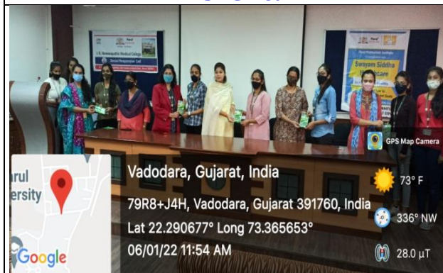
Distribution Of Hygiene Seat Cover To All Female Students And Faculties