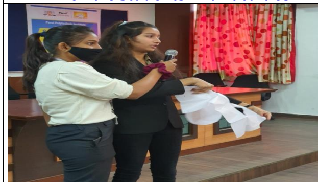
Demonstration by SRC Team How to use HYGIENE SEAT COVER