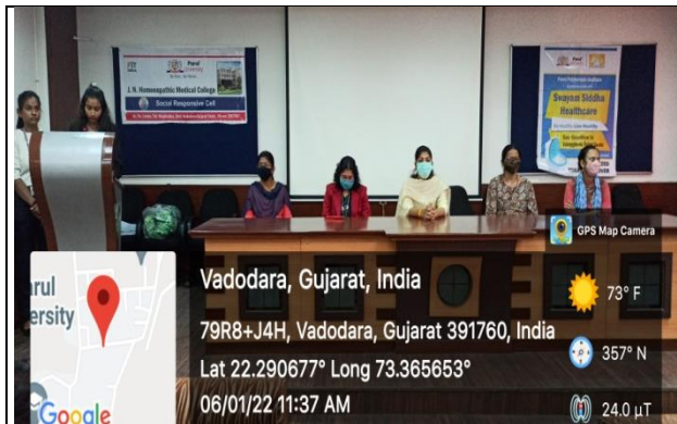
Programme Hosted by PIP - SRC Team