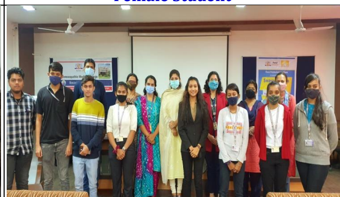
SRC Team - PIP and JNHMC